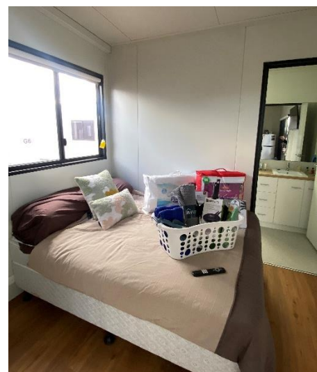
Kitchen/dining and bedroom – Hutchinsons Modular Home